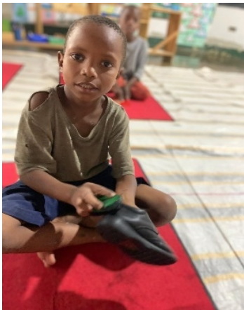
Montessori 'Lessons from daily life' : Polishing shoes