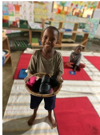
Happy with the result!

This chart shows how loud a sound can be in dB. The red circle indicates the volume of normal speech. With a hearing loss of 50 dB or more, children miss almost everything that is being said.